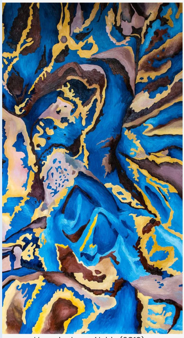
Home by Laura Noble (2019)

Apply to display your art at a nonprofit art exhibition at ARU in collaboration with a variety of charities to raise awareness on domestic abuse. We welcome diverse perspectives on the theme and its complexities.